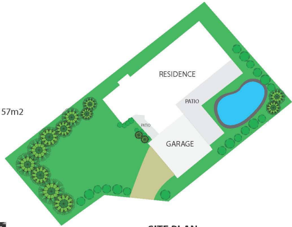
SITE PLAN Approximate land area 704m 2